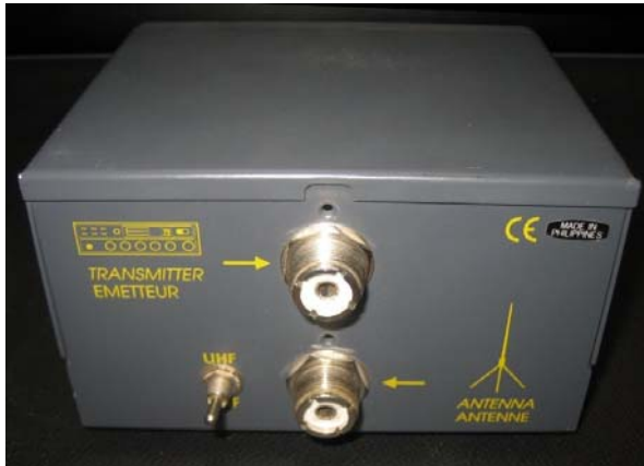
Ansicht von Rückseite incl. HF-Buchsen sowie VHF/UHF Bereichsumschalter