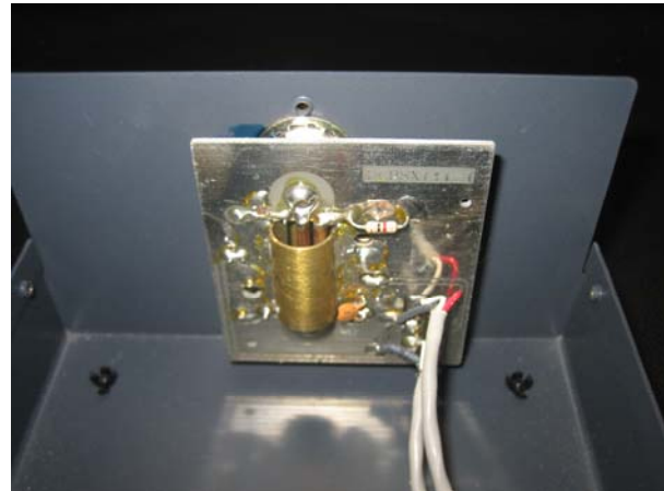
Ansicht Rückseite von Innen