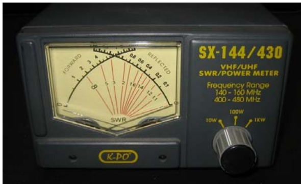
Ansicht Front (links Kreuzzeigerinstrument)