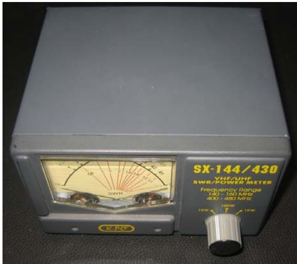
Ansicht Front (rechts Leistungsumschalter)