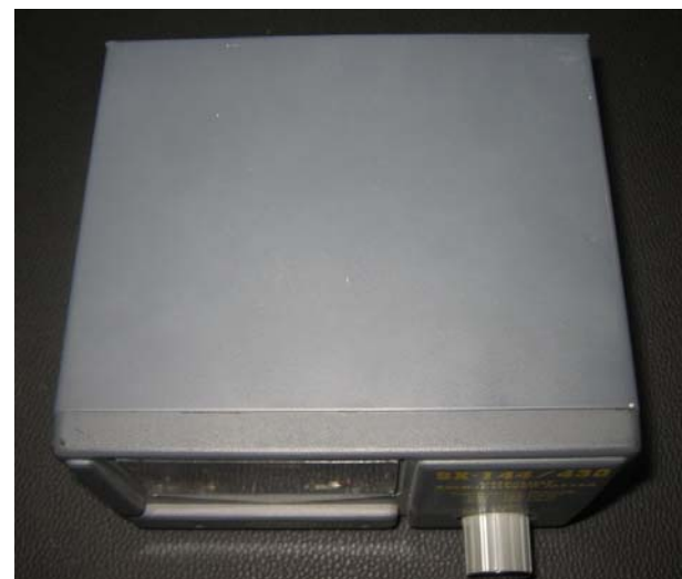
Ansicht von Oben